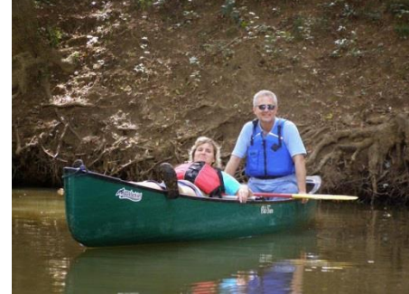
A trolling motor would be nice...